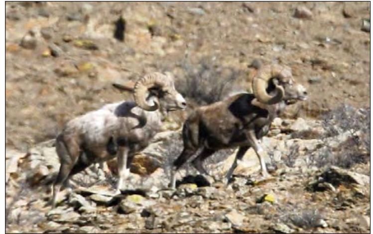
Argali sheep exist in sufficient numbers to support a limited, sustainable hunting program. After meetings in Urumqi, Karl Malcolm was taken on a tour of argali sheep habitat in northern Xinjiang Province.

After two days of meetings in Urumqi, forum participants were taken on a two-day, 1,000-mile field trip in northern Xinjiang Province that had been open to limited hunting in the past. China contains sufficient populations of several species (for example, blue sheep and argali sheep) that would be of great interest to international hunters